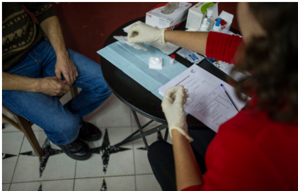
Outreach testing: "European HIV Testing Week" in Mouraria Harm Reduction Centre, Lisbon, Portugal.

female peer workers in order to encourage women to access harm reduction and treatment services. 19 Nevertheless, much more remains to be done to ensure that the services available for people who use drugs are tailored to women and are provided in a non-judgemental, non-discriminatory manner. 20 For instance, specific harm reduction and treatment services should exclusively target women, or those already available should have opening hours for women only, and should include childcare for women with children, incorporate sexual and reproductive health interventions, and provide social support for women and mothers. 21