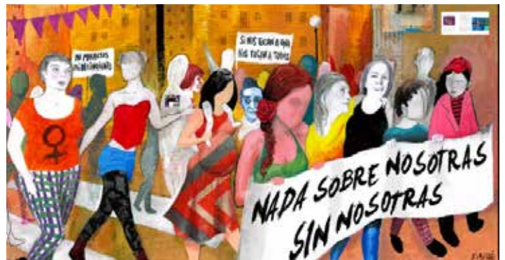
“Nothing About Us Without Us.”

The all-female team that makes up Metzineres is interdisciplinary, with two experts in drug policy, gender mainstreaming, and harm reduction; a project officer specialized in law; a coordinator of Women Promoters of Harm Reduction ( Mujeres Impulsoras de Reducción de Daños , DIRD); a doctor; a social worker; a social educator; a nursing assistant and Kundalini Yoga workshop facilitator; a social integration specialist who is also a graphic artist and designer; and workshop facilitators, volunteers, interns, and neighbors who offer their collaboration and skills.