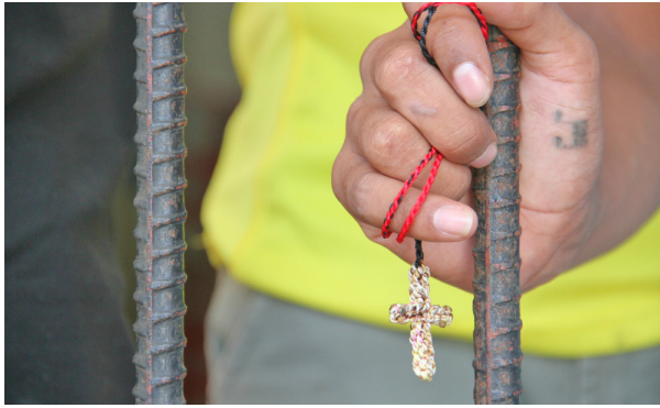
Woman incarcerated in El Inca prison, Ecuador.

producing a decline from 18,675 people incarcerated in 2007 to 10,881 in 2009." 7