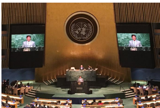
Civil society intervention at the Plenary of the UNGASS

money laundering / international cooperation), and should be maintained for future UN drugs documents and processes as it better reflects the cross-cutting nature of drugs, and links back to the key priorities of the UN system – the protection of health, human rights, human security and development. In many parts, the language from 2016 is also an improvement on 2009 and before – and all efforts must be made not to regress. 25 To this end, the reference in the omnibus resolution to follow up on UNGASS implementation in line with the seven thematic areas is to be welcomed (see Box 3) and provides a strong basis for continuing to broaden out the drug policy debate.